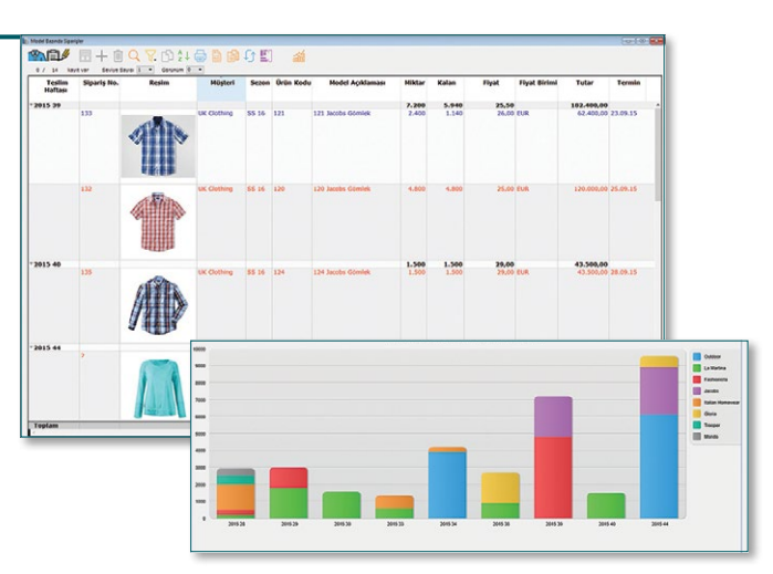
Weekly Deliveries by Brand